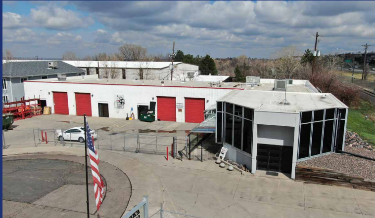
616 MOSS STREET

616-655 MOSS STREET Golden, Colorado 80401