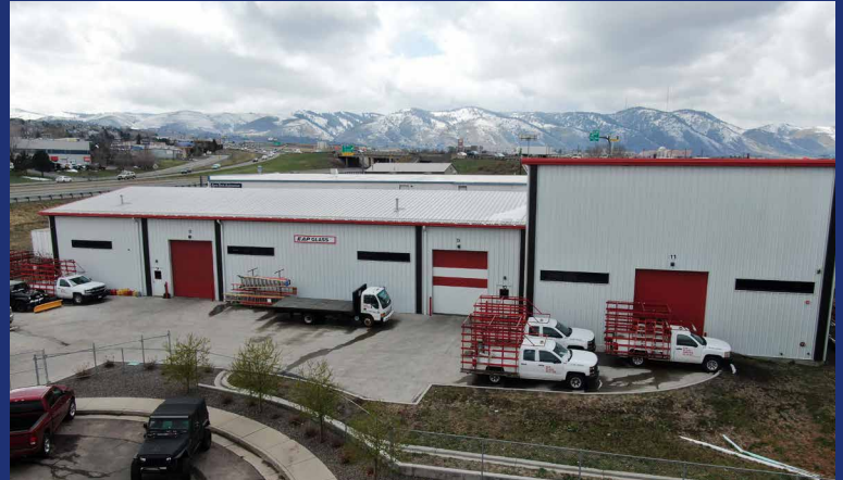
655 MOSS STREET