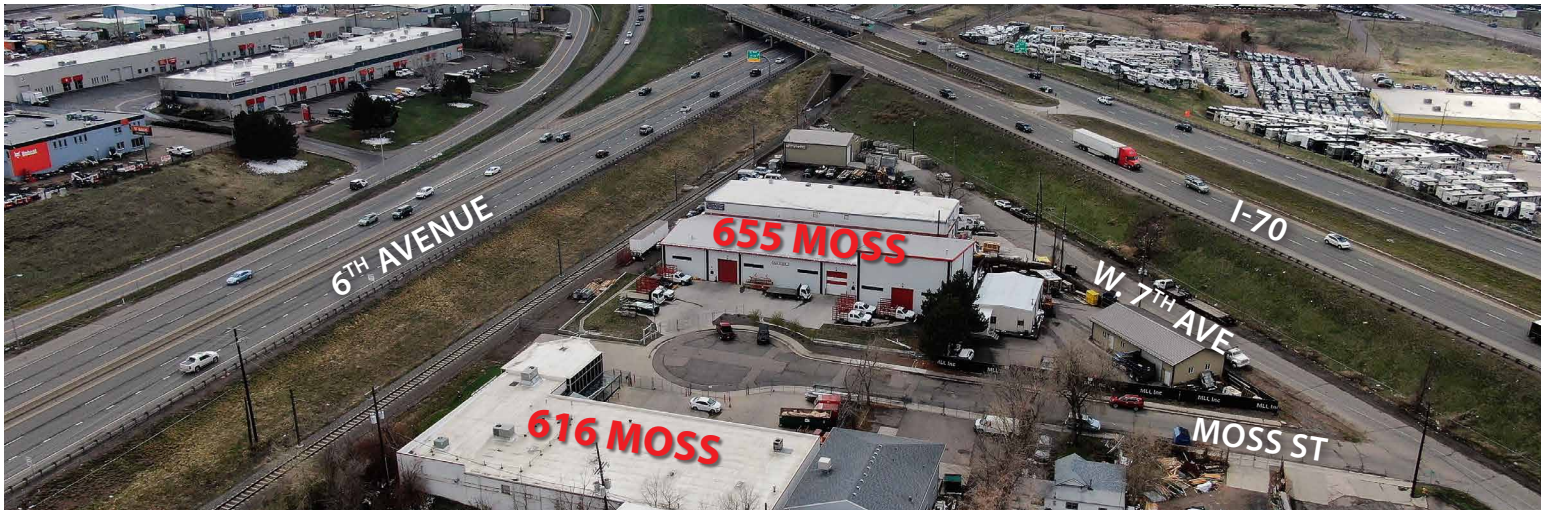
616 MOSS STREET